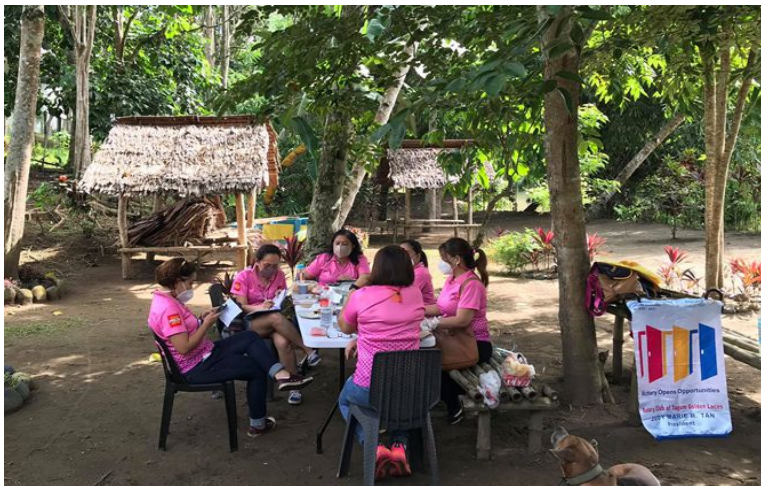
17 Oct 2020 Madgao Eco-Park