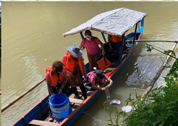
Turn-over of Trash Bins and River Clean up 17 October 2020 Madgao Eco-park, Asuncion, Davao del Norte