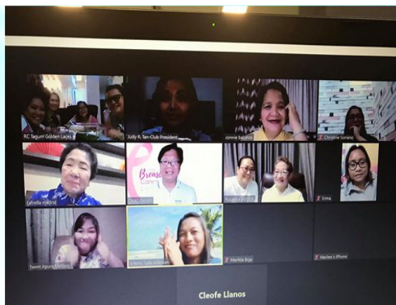
Special BOD Meeting with DMC Chi Uy 23 October 2020