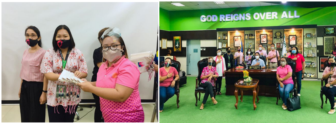
Turn-over of Kamay Gabay Kits (Breast Cancer Awareness Kits) 28 October 2020 City Mayor's Office