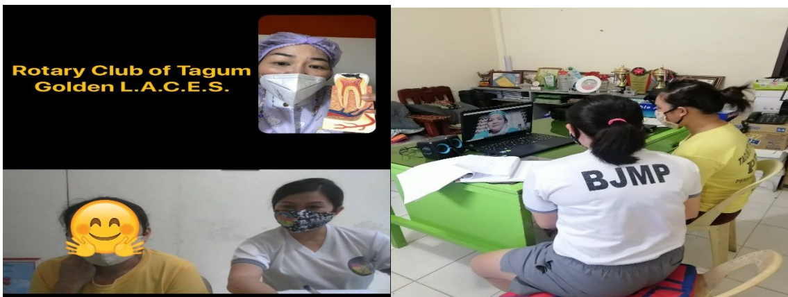
Dental and Medical E-Consultation 28-29 October 2020 Tagum City Jail Female Dormitory