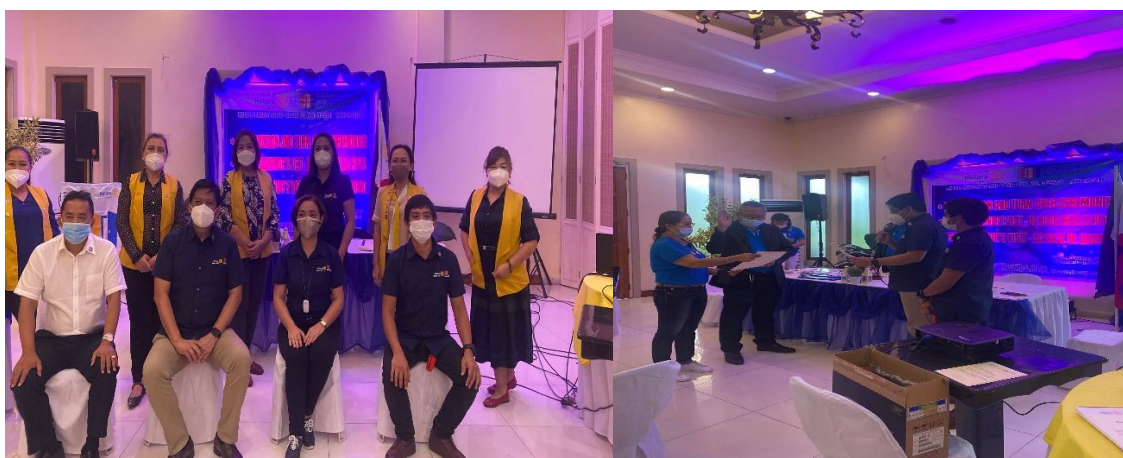
Induction of Officers of RC Compostela Valley 06 October 2020 Nabunturan, Davao de Oro