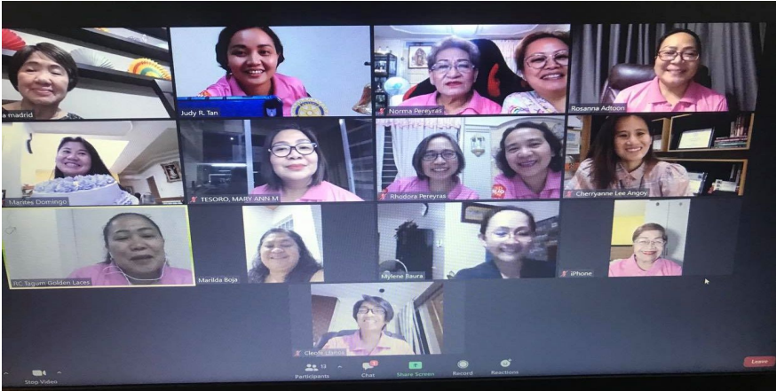
5th Virtual Meeting 09 September 2020