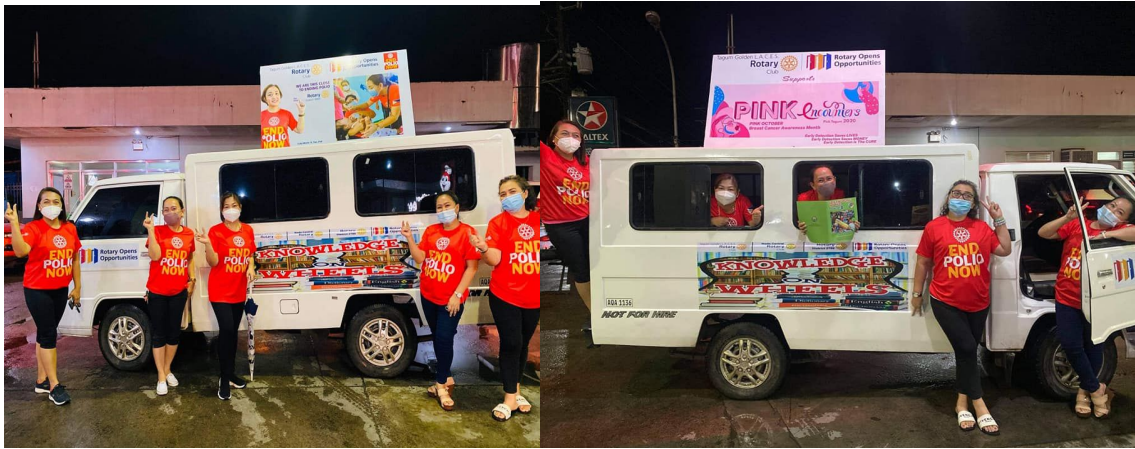
Launching of Magnetic Rooftop Signage featuring End Polio campaign and Pink Encounters 24 October 2020